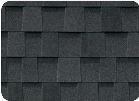
Black Shadow IR