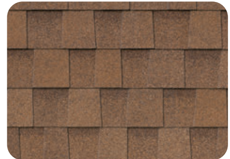
Desert Shake IR