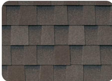
Weathered Wood IR